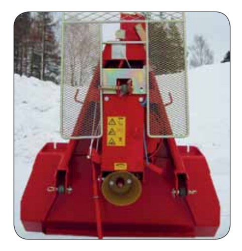
Power shaft in the center line of the winch

The FARMI 501 winch (with 11,000 lbs pull for tractors from 35 HP and up) is manufactured with an integrated butt plate and a vertically adjustable lower cable pulley: a rugged and stable winch.